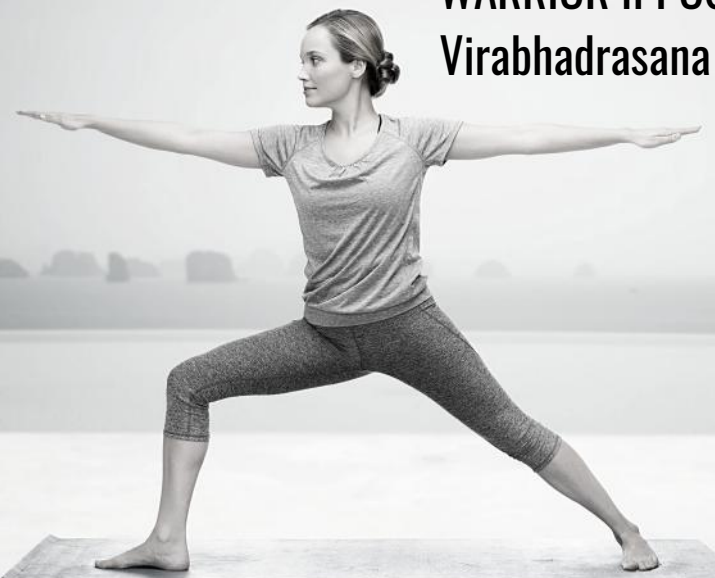
WARRIOR II POSE Virabhadrasana II