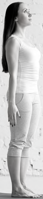
MOUNTAIN POSE Tadasana