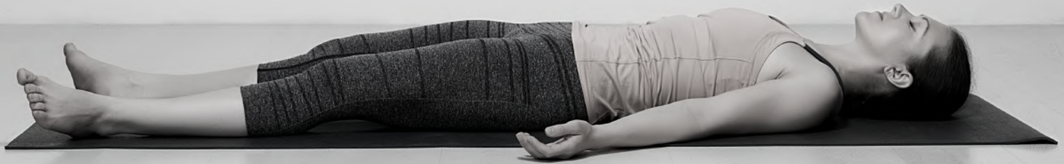
CORPSE POSE Savasana