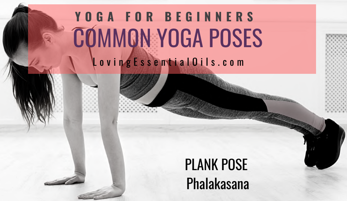
PLANK POSE Phalakasana