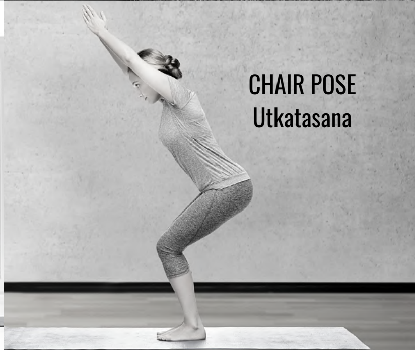
CHAIR POSE Utkatasana