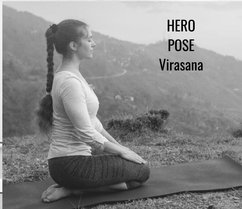
HERO POSE Virasana