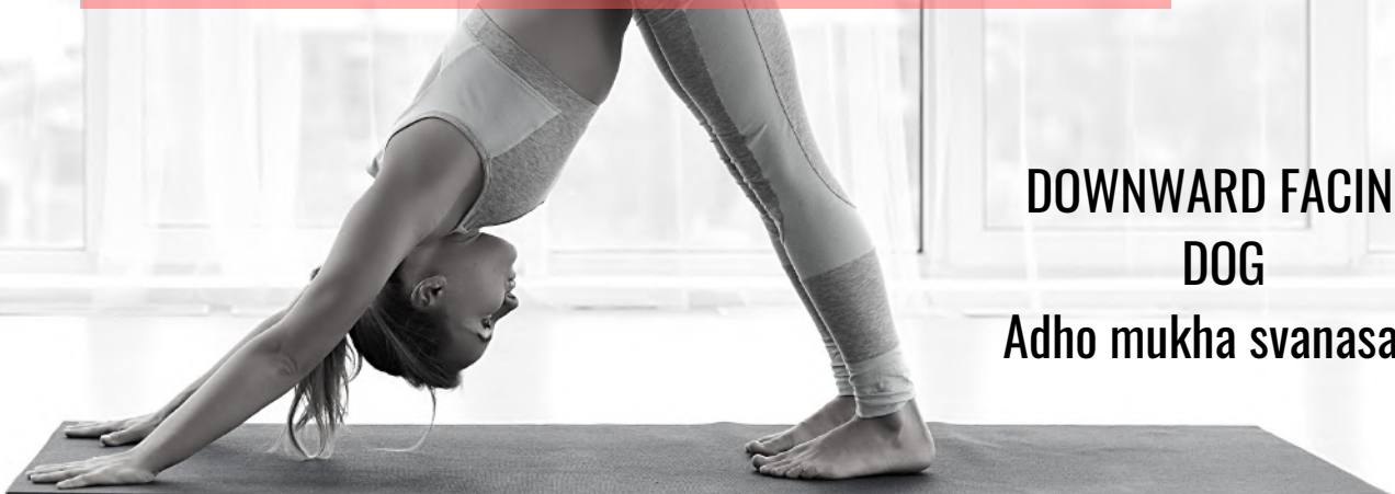
DOWNWARD FACING DOG Adho mukha svanasana