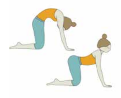
37. Cat Cow Pose (com... Chakravakasana